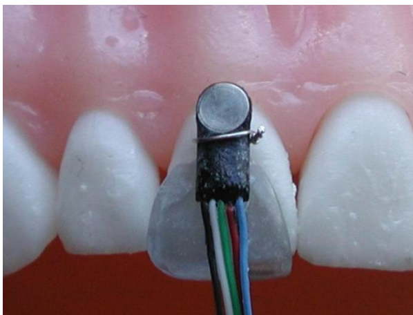
Figure 3: Transducer placed on the labial surface of upper central incisor.