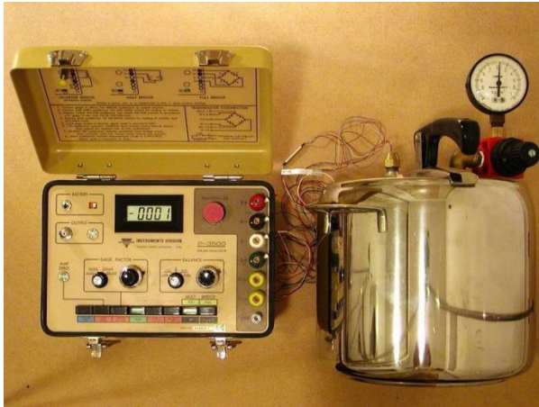
Figure 1: Laboratory calibration (the calibration of the transducer by using a pressure chamber)