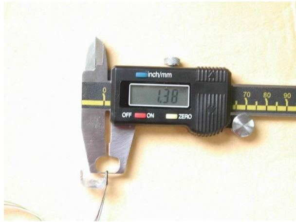
Figure 6: Transducer and stent thickness.