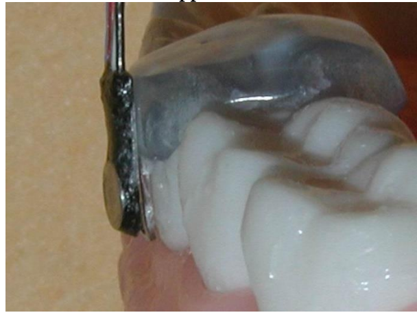
Figure 5: Transducer placed on the buccal surface of lower first molar.